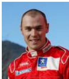
Richard Burns 1971-2005